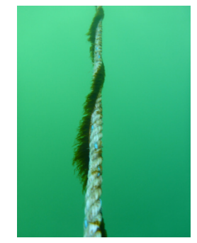
Young kelp growing on longline