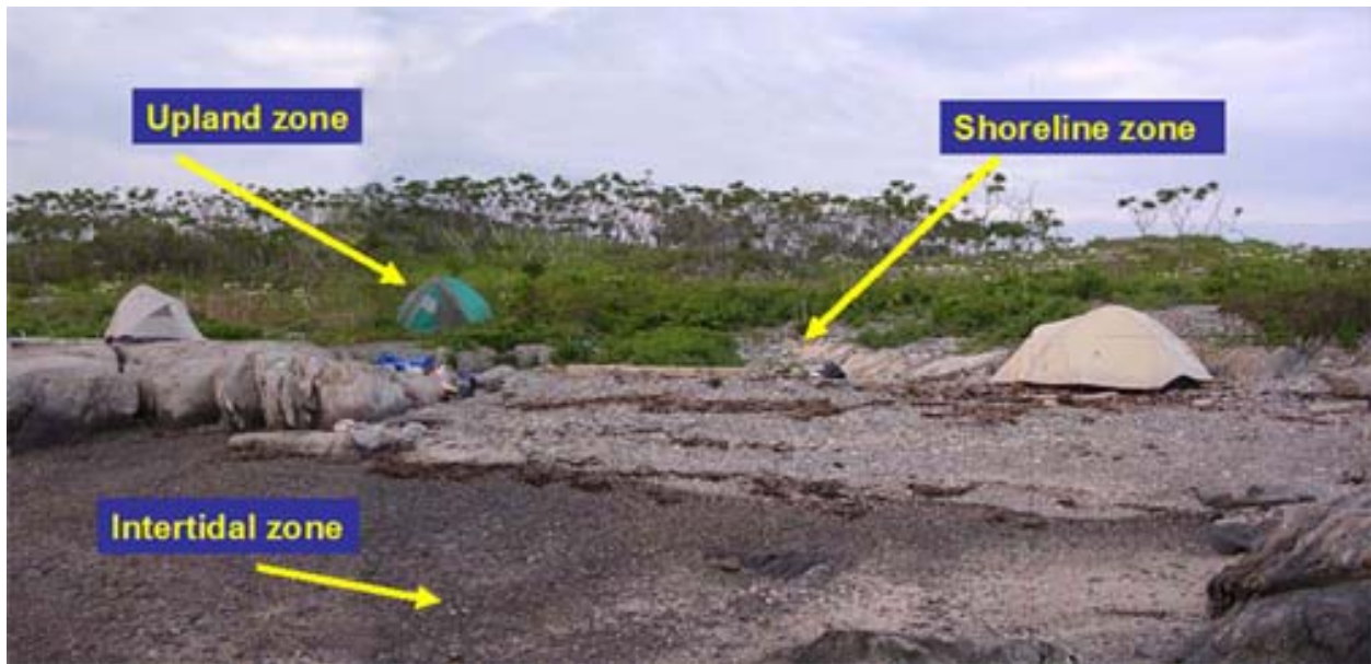
This image of Bangs Island shows the three island zones.

We relied heavily on existing recreation impact monitoring methods (see bibliography in Appendix C). However, islands present a unique recreational environment. Unlike large wilderness areas, for example, where use tends to be concentrated specifically on trails and at campsites, people visiting islands move freely through three environmental zones: terrestrial, shoreline, and intertidal. Thus, methods for baseline assessments needed to be developed for each of the three zones and their specific impact indicators.