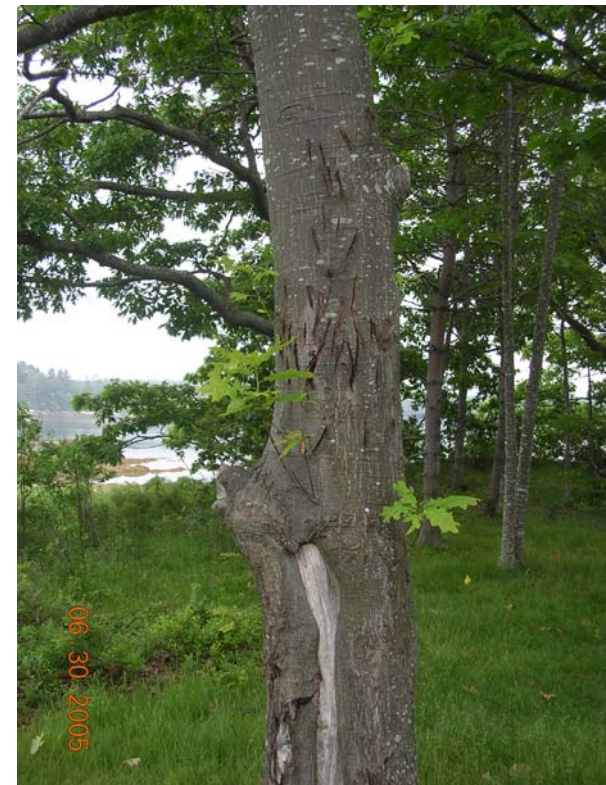
Photo 110, June 30, 2005