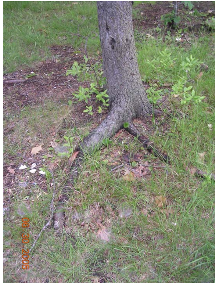
Campsite LSI_C, Photo 114, June 30, 2005