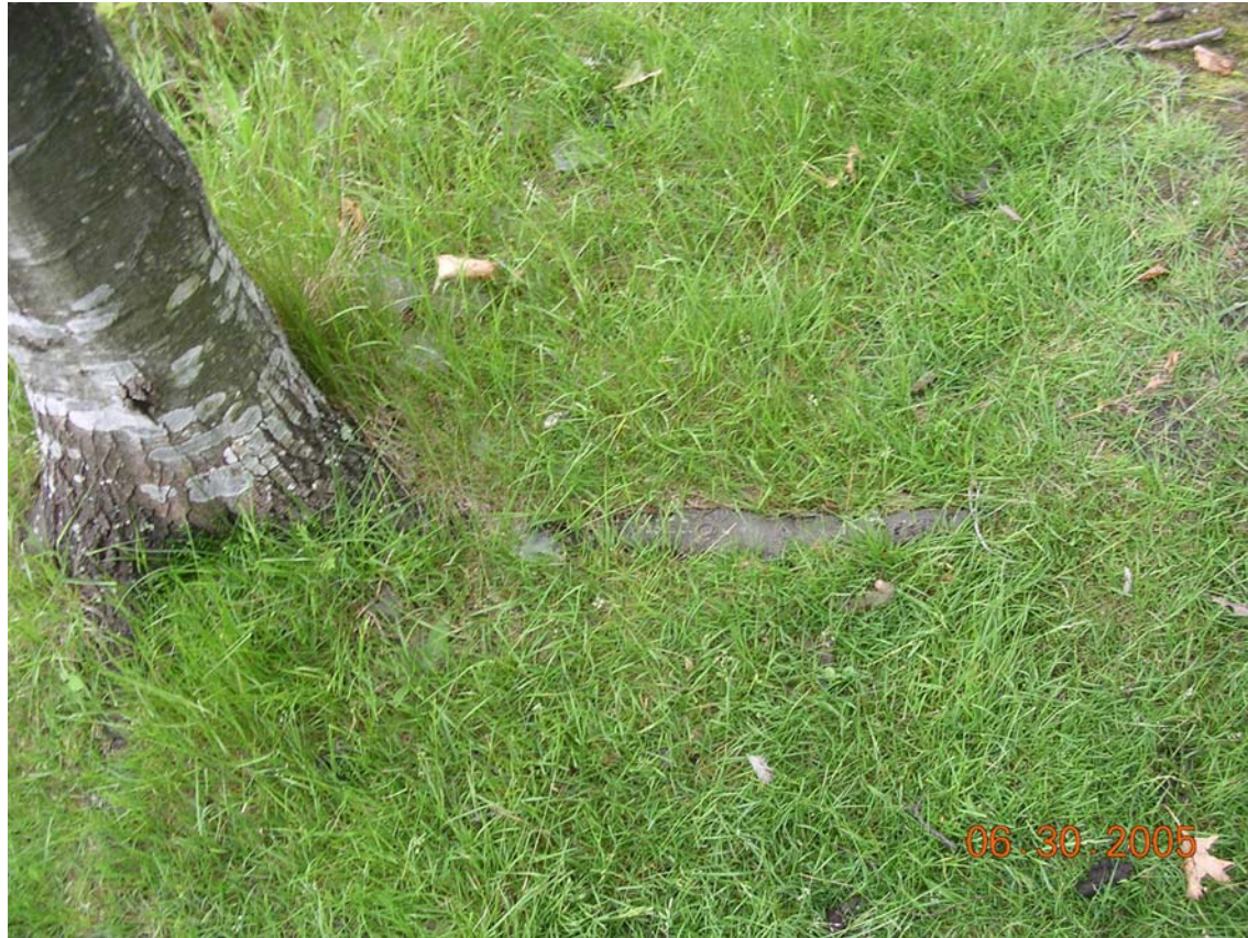
Campsite LSI_C, Photo 112, June 30, 2005