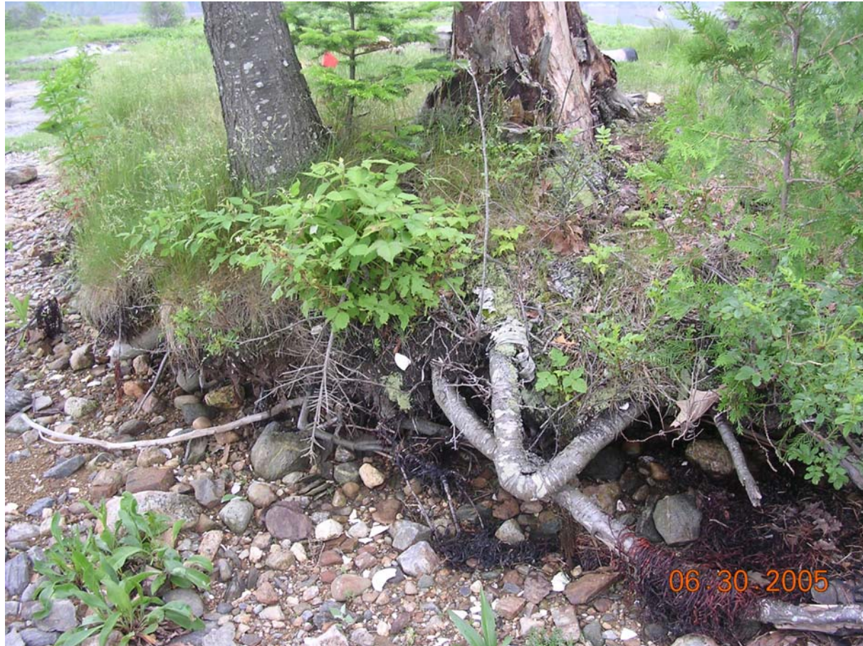
Campsite LSI_C, Photo 115, June 30, 2005