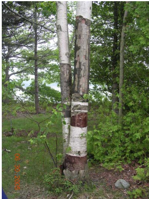
Photo 103, June 30, 2005