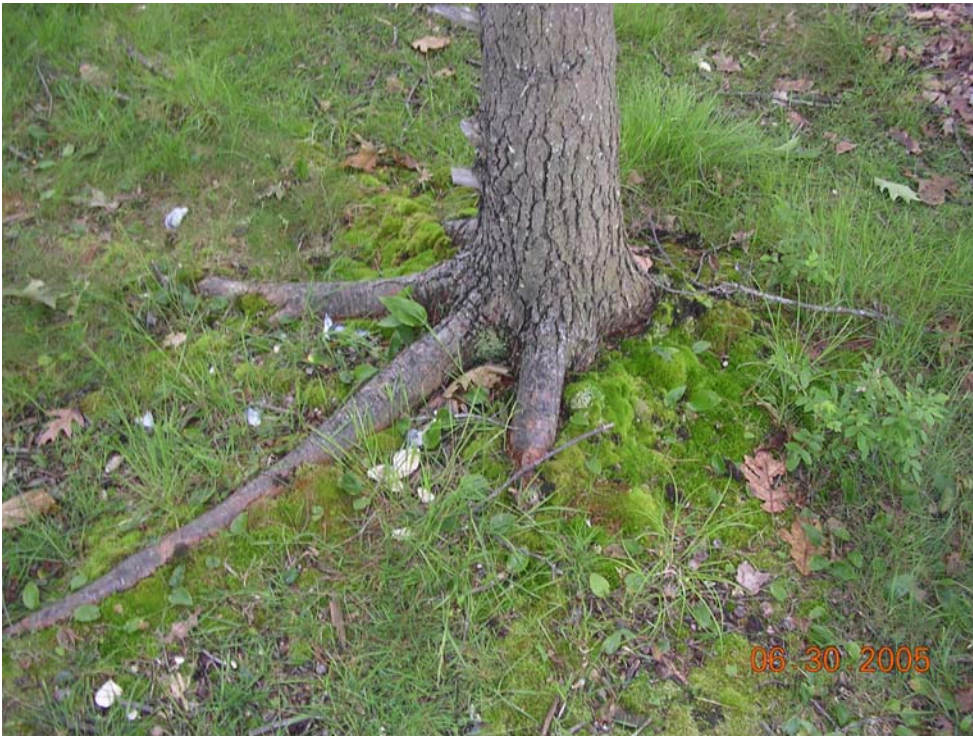
Campsite LSI_C, Photo 113, June 30, 2005