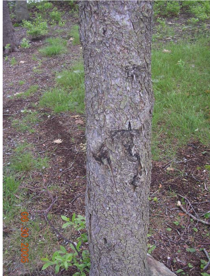
Campsite LSI_C Photo 107 June 30, 2005