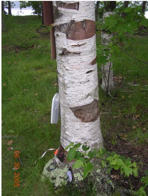
Above: Campsite LSI_C Photo 104, June 30, 2005

HEAVY = BRANCHES REMOVED, SCARRING, AND GIRDLING