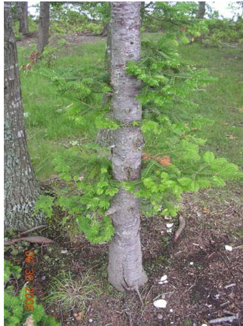
Above: Campsite LSI_C Photo 105, June 30, 2005