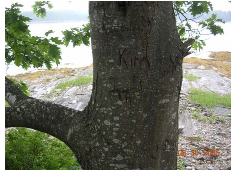
Photo 108, June 30, 2005