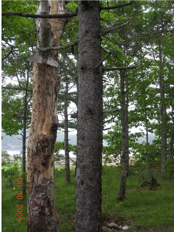
Campsite LSI_C Photo 106 June 30, 2005