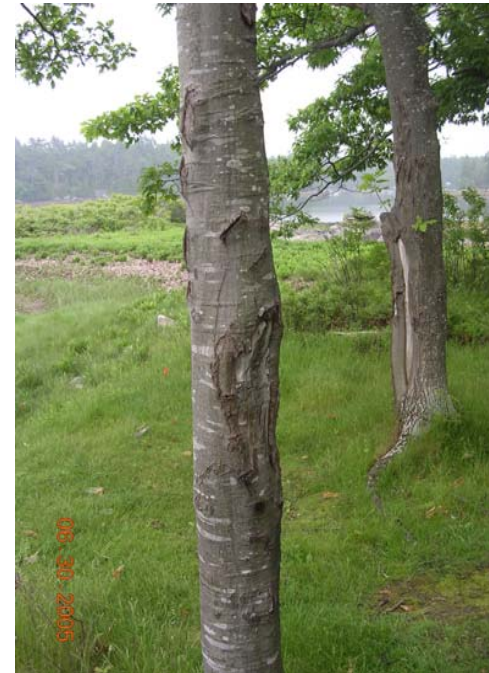
Above: Campsite LSI_C Photo 111, June 30, 2005