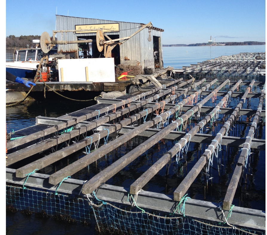
Mussel rafts at Bangs Island Mussels, Casco Bay, ME

Surprisingly, aquaculture in Maine is relatively undeveloped compared to both surrounding states and nations. Currently there are fewer than 300 full-time workers employed in the shellfish and seaweed industries in Maine, less than 5% of the number of commercial fishermen in the state.