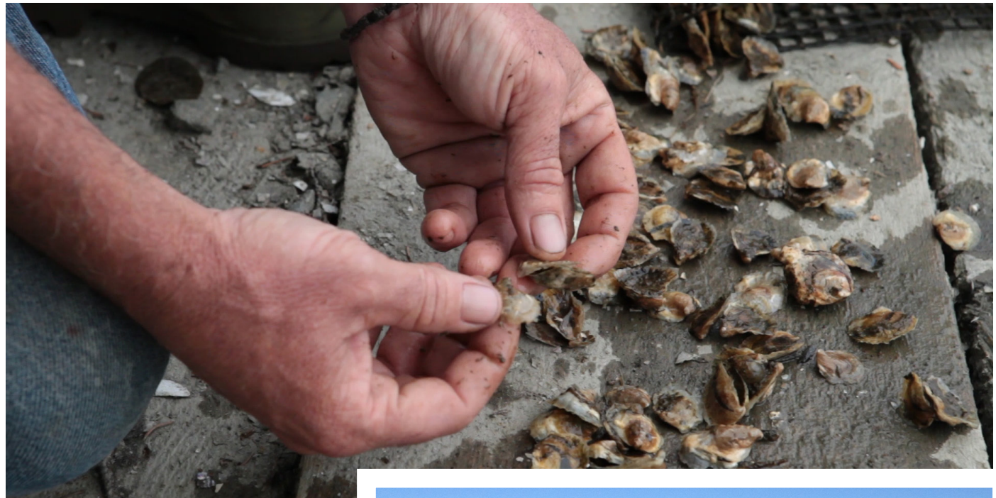
Baby oysters on North Haven, ME

While traditionally the world's supply of seafood has come from wild-caught fish, in the last fifty years, aquaculture has rapidly expanded as a food-producing industry, and now makes up almost half of the seafood consumed in the world. Much of this growth has taken place outside of the United States; however, as a country, we import 85% of our seafood, more than half of which is farmed. While it is hard to know the environmental and social impact of seafood caught and farmed overseas, by growing more of it locally, we can ensure that our morals, taste buds, and pocketbooks are happy.