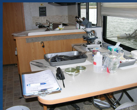
The dinette seat that was removed was replaced with a small shelf for the microscope. The table serves as the necropsy area.