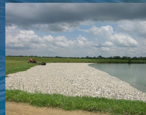
Sometimes the map of the ponds is not needed, and problem ponds are easily spotted. Massive fish kill due to toxic algae.