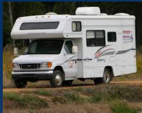
2005 Winnebago Minnie purchased for conversion into lab. This vehicle is 22' long.

The authors wish to thank the West Alabama Catfish Producers for funding of the mobile lab and the original modifications. We also thank the Alabama Farmers Federation - State Catfish committee for providing additional funding to upgrade the counters and equipment in the lab in 2019.