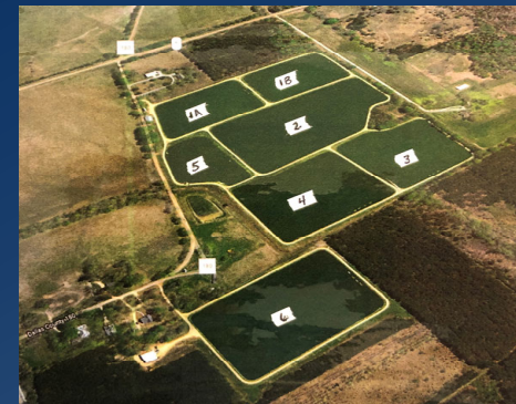
Maps of the farms with labeled pond numbers helped with social distancing during the pandemic. Producers need not be present when the diagnostician is on the farm. Pond numbers enabled location of problem ponds.