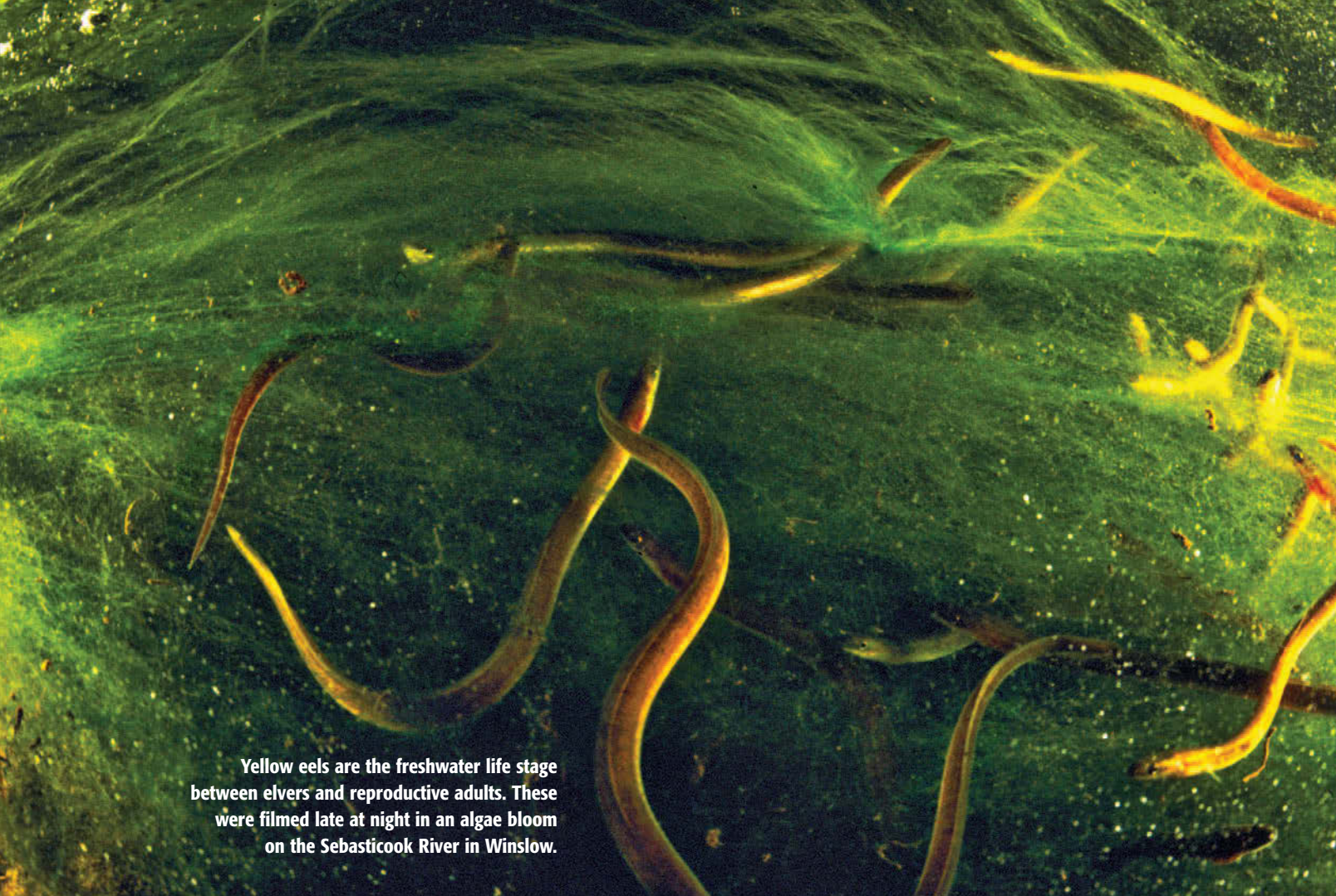
Yellow eels are the freshwater life stage between elvers and reproductive adults. These were filmed late at night in an algae bloom on the Sebasticook River in Winslow.