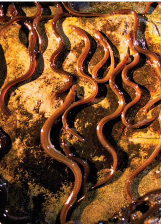
Migrating ever upward, mostly at night, adolescent eels can even climb dam walls.

While spawning activity remains undocumented, larval eels appear in the ocean currents in and around the Sargasso. After making a genetic note about how to get back someday, baby eels ride the Gulf Stream north.