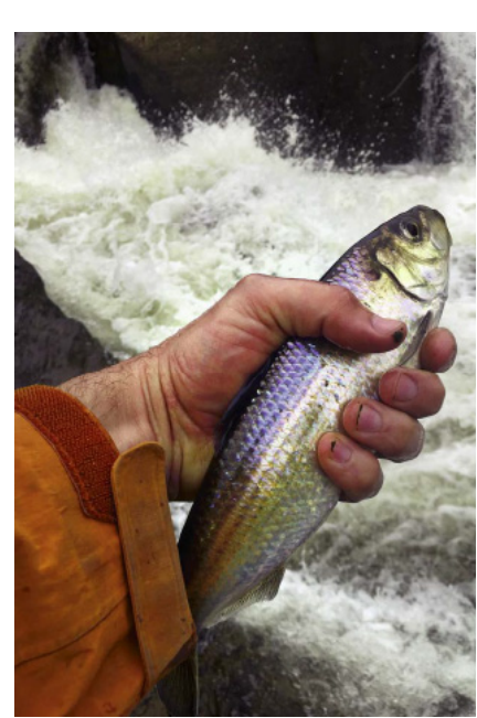
This alewife was caught by dip net in May 2017, one of many thousands of river herring that returned to downeast rivers to swim upstream and spawn in lakes and ponds. Organizations like the Downeast Salmon Federation work with communities to eensure unimpeded fish passage for all sea-run fish, including river herring.

migration, and in the 20th century, when more dams went up and water pollution kept them away.