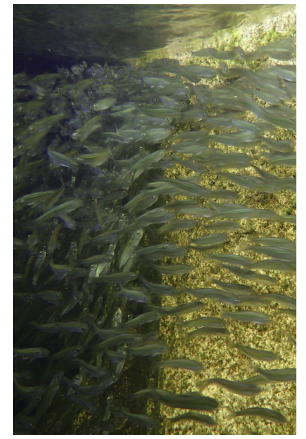
Juvenile alewives swim in Long Pond on Mt. Desert Island. As restoration has reconnected more Maine lakes to the sea, alewife populations are rebounding.

Maine alewives, part of an Atlantic coast population that extends from Canada to the Carolinas, once numbered in the millions. Historically, alewives lived in virtually all lakes accessible from the ocean. They