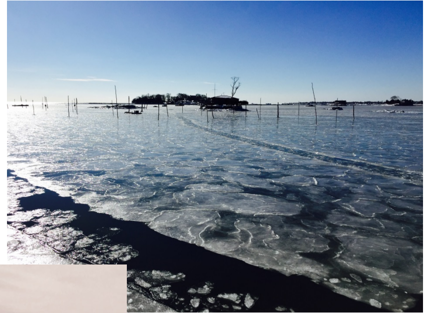
Stony Creek, Branford, CT Feb. 2015