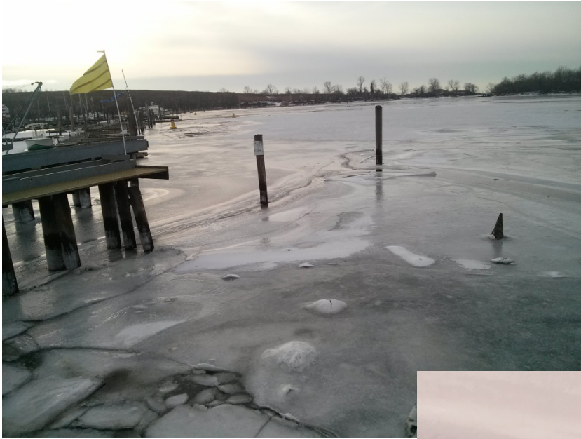
Captains Cove Bridgeport, CT Feb. 2014