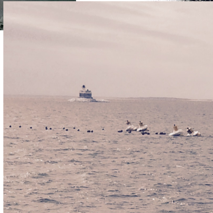
Anchorage systems moved by ice Feb. 2015