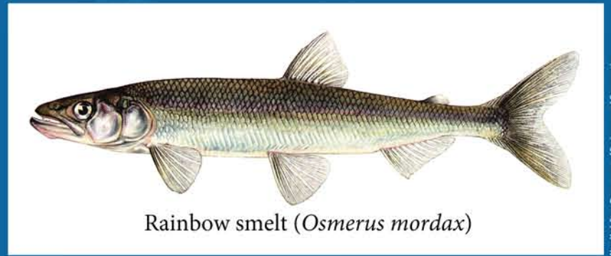
Rainbow smelt ( Osmerus mordax )

Large quantities of smelt were once harvested by commercial fishermen in Maine. Today, people fish for smelt with hook and line through the ice in winter and with dipnets in spring. In spring, up to two quarts of rainbow smelt may be harvested by anglers who have signed up with Maine's Saltwater Recreational Fishing Registry.