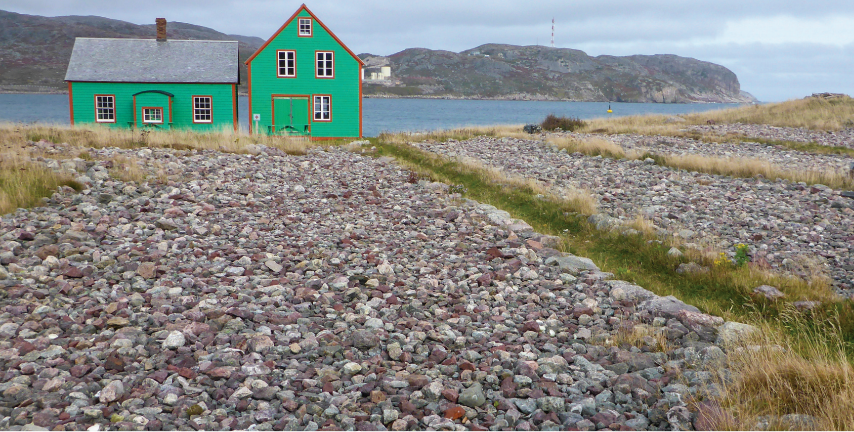
L'île aux Marins, a 10 minute ferry ride from Saint-Pierre, was once home to hundreds of cod fishing families who dried their catch on gravel beds maintained mostly by children.