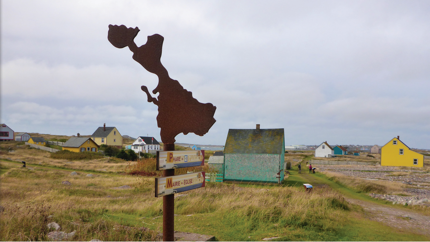
Tourism, focused on the archipelago's rich fisheries heritage and maritime environment, is an important strategy in the French government's plan for Saint-Pierre et Miquelon's future. This image was shot on L'Île aux Marins, and the steel map represents that island.

boost regional development while counting on market forces to usher in new industries, but risk a declining population? Or would we choose the French approach of assuaging economic crisis with an outpouring of government jobs and subsidies, while risking a dependent population?