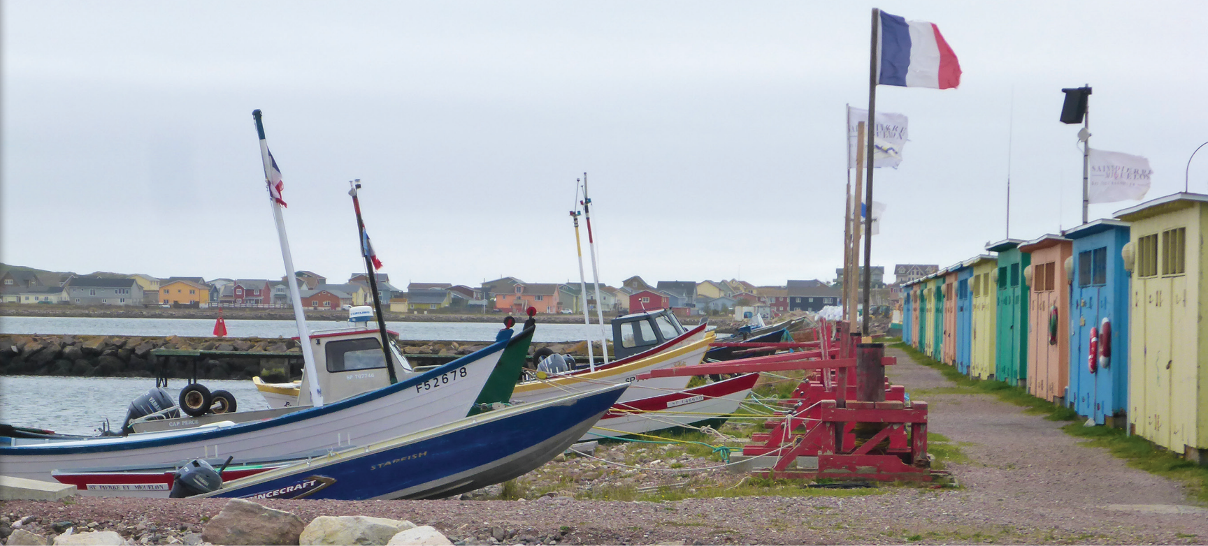
“Les Salines” or salt houses, where dory fishermen processed their catch and maintained their boats.

(continental France) working in bakeries, hotels, restaurants, government posts, and even as deckhands in the fishery, like the young woman who had come for a job on a groundfish trawler.