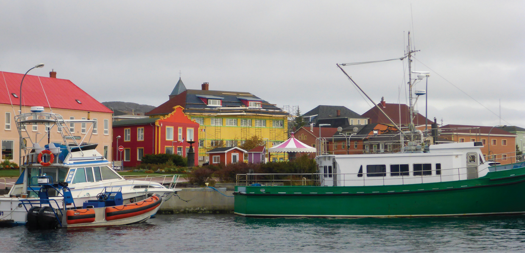
The Saint-Pierre harbor lies at the edge of the Place du Général de Gaulle.