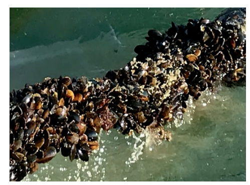
Blue Hill Bay Mussels, LLC and the Downeast Institute are collaborating on new hatchery technologies to better control settlement of mussels on ropes.