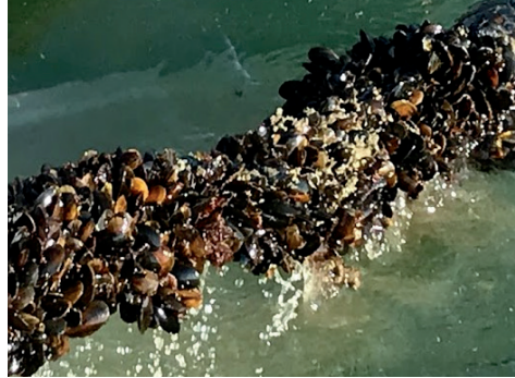
Blue Hill Bay Mussels, LLC and the Downeast Institute are collaborating on new hatchery technologies to better control settlement of mussels on ropes.