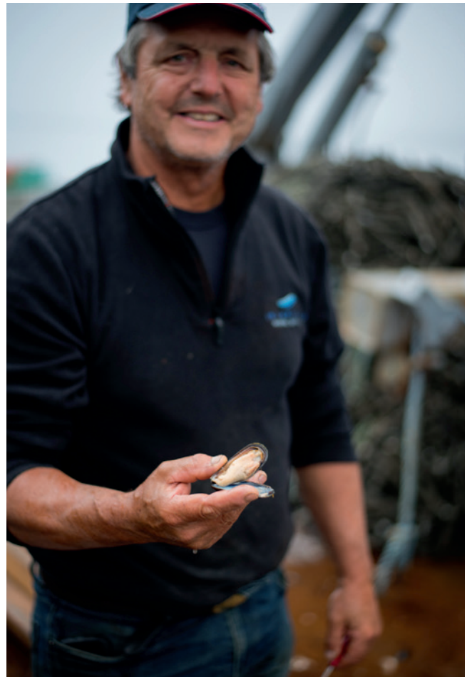
The Alliance is enabling new technologies, like submersible mussel rafts and growing scallops using Japanese ear-hanging methods, that boost Maine's aquaculture industry. Top photo by Kari Paine. Bottom photo courtesy of Coastal Enterprises, Inc.

Since 2016, the $7,000,000 Alliance investment has been enhanced by $20,340,302. Leveraged funds will continue to be tracked and reported.