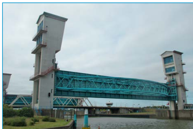
The Hollandsche IJssel storm surge barrier was the first component of the extensive system of Dutch flood protection measures called the Delta Works. The barrier was built in 1958, just five years after the devastating floods of 1953 that initiated the Dutch government's efforts to take full responsibility for flood protection in the country.

Understanding the approaches used by the Dutch to confront the Myth of Dry Feet may provide New Englanders with models. How are the Dutch effectively engaged in planning for flood defense? How are communities in New England engaging stakeholders in these same conversations as we become aware of our own vulnerabilities? Are there lessons from the Dutch that we can apply here at home?