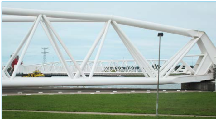
The Maeslant storm surge barrier is the most recent element of the Delta Works, completed in 1997. It is one of the three structures that protect the Port of Rotterdam. When it closes, the barrier’s two massive doors fill with water. Within two hours, the doors sink to the bottom to hold back the flood waters.

In a sense, both the Netherlands and New England are confronting our own societal “Myths of Dry Feet”. While the national management of water to defend against flooding essentially makes life in much of the Netherlands possible, it has become such a routine and expected part of that life that most Dutch citizens don’t even think about it anymore. This has fostered the Dutch expectation that they have a right to dry feet . Conversely, daily life here in New England is unfettered by the management of water on a Dutch scale, and yet devastating flooding has been rare. It’s possible that this has lulled New Englanders into our own myth — we can expect to have dry feet in the future, because we’ve generally had dry feet in the past. Yet as storm frequency and intensity and sea-level rise rates all increase here in New England, we can no longer look to the past as the guide to our future. As we in New England start to engage in confronting our own myth, Dutch practices may inform our path forward.