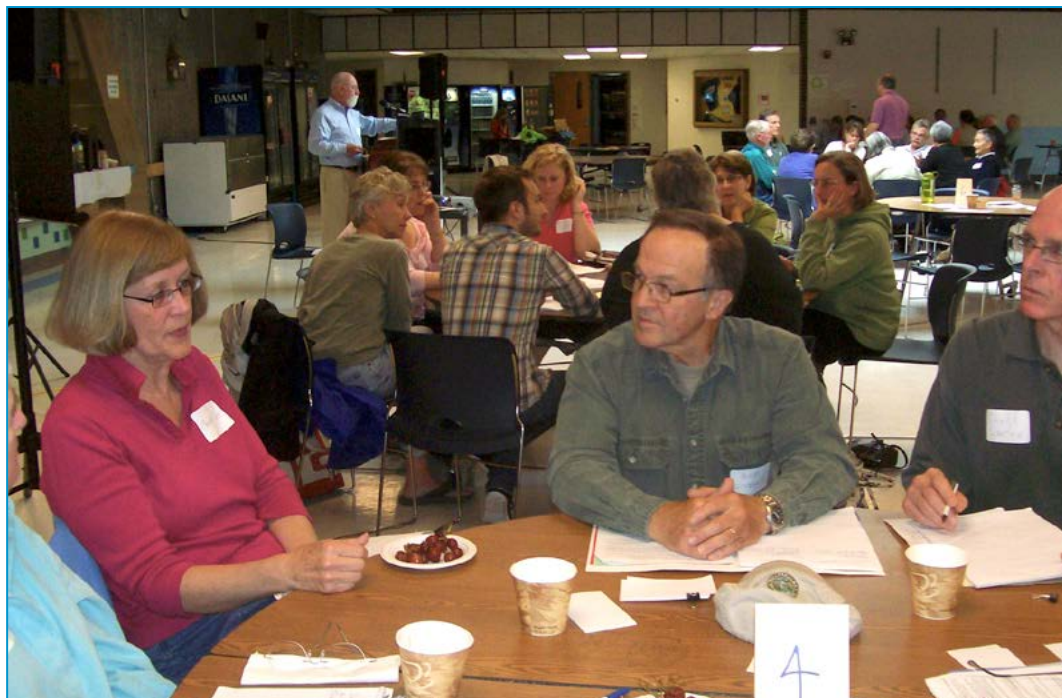
Trained, volunteer facilitators at a community forum in York, Maine help to maintain a neutral process in break out groups.