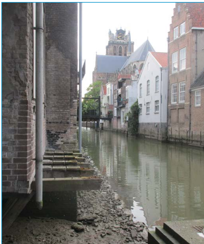
This area in Dordrecht in the Netherlands is among only a few populated locations in the country that is not protected by a primary dike, and therefore exposed to high risk of flooding from the ocean. Here visitors can see the bottom of the canal at low tide, an extremely rare sight in the Netherlands.

Planning for flood defense is an endeavor that requires cooperation from partners across traditional boundaries of geography, knowledge, and skill.