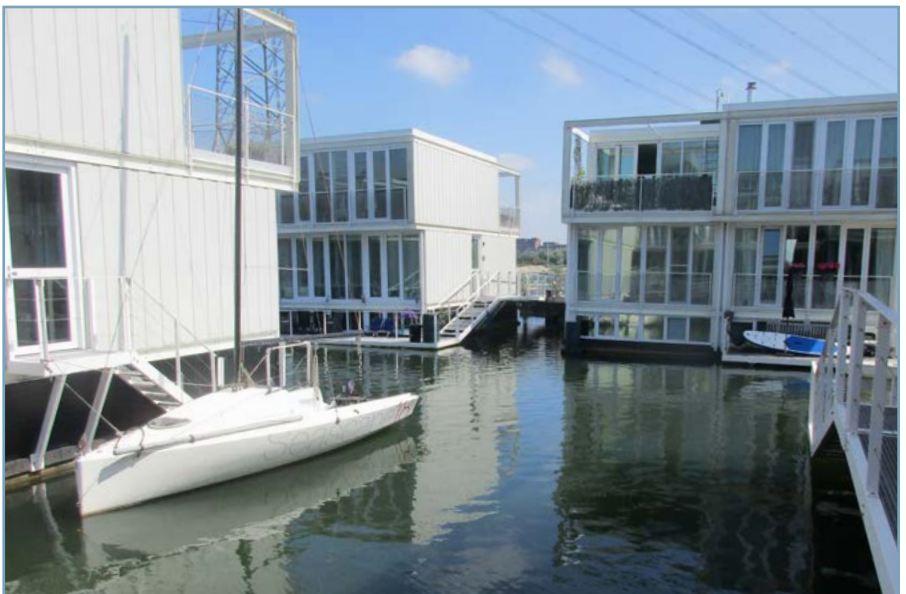
The floating neighborhood of IJburg in Amsterdam where homes are built over artificial islands raised from IJmeer Lake, as a means of food protection.

Facts and data must be viewed as credible and legitimate by stakeholders. Participation of all stakeholders in developing knowledge may help promote stakeholder trust in the information. Additionally, efforts to make abstract data more concrete also help to improve trust in the information. Use of maps, visuals, local scenarios, and stories from personal experiences can make information more tangible, personally relevant, and real