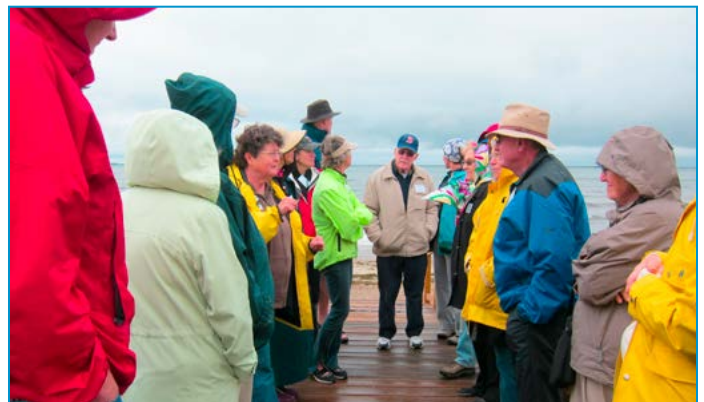
Local residents in southern Maine tour sites where property owners have taken action to address impacts of flooding and erosion, enabling participants learn from each other.

Stakeholders are more motivated to engage when the issues or events that present risks are close in time and space, so that the memory of the experience is fresh. The Dutch have been actively defending their country against flooding for hundreds of years, and consequently the risk has been and will continue to be ever-present in the Netherlands. Therefore, it may be that if the question in the Netherlands is when , the answer has always been now , making this question somewhat less relevant in the