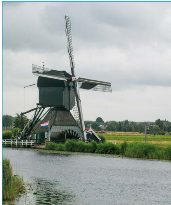
A windmill in the south of the Netherlands operates to pump water out of the floodplain and into the canal, creating drained land called a polder.

To provide us with scale and context for this study, consider that the Netherlands is roughly half the size of Maine, but with a population of 17 million or approximately 13 times that of Maine's. In this context, flooding in the Netherlands could be considered a threat to the Dutch culture itself and that the issue is relevant on a national scale. Conversely, the geographic size and diversity of Maine (and moreover, the United States) suggest that in order for the context to be made relevant for Maine and American stakeholders, especially those at the community level, engagement in planning for flood defense may be more effectively addressed at a regional or even local scale.