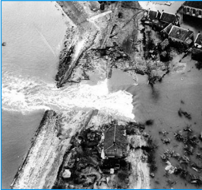
A dike in the south-western part of the Netherlands breaks during the flood of 1953. The flood killed more than 1,800 people, flooded 500,000 acres of land, and forced 72,000 people in the most densely populated part of the country to flee their homes.