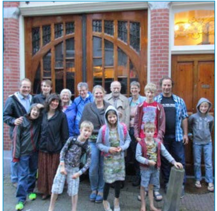
Thank you to my Dutch family and friends.

I would like to thank the Dutch and New England practitioners, academics, and government officials whose willingness to share their thoughts and experiences made this study possible. My Dutch family and friends, as well as my own family, were also key supporters. I would also like to thank the University of Maine and Maine Sea Grant for supporting the sabbatical leave that provided the time needed to conduct this study.