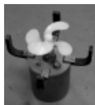
Figure 1 Axial flow pump

consists of ten 55-gallon plastic drums (silos) connected along the pipe's length (figure 2). The pump is constantly trying to empty the pipe, drawing water from each mesh-bottomed drum and creating flow through the seedbed. Modules can be combined to make a system tailored to the dock available, or a custom dock can be constructed around modules. The basic system described here uses two modules placed end to end between two 4-foot x 24-foot floating docks (figure 3). This catamaran design has proven very stable and provides a working platform that is low to the water, making servicing the silos easier. The total area required by the system is 16 feet wide by 24 feet long. Note that 8 feet is necessary between the floats to allow for the trunkline, drums as well as room to remove and connect the silos. The system draws 3\frac{1}{2} feet if full-length drums are used. Short half-drums can be made, but these will reduce capacity for species such as oysters and scallops that can fill the silos to the outflow port. Also, a cut drum's shape is compromised unless reinforced.