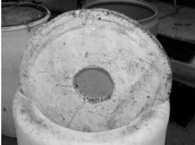
Figure 5 – Foam being inserted into top of drum

the mesh to the silo. For small mesh (less than 2-millimeters) hose clamps and/or strapping can be used to temporarily hold the stretched mesh in place while the glue sets (figure 6). While different adhesives have been used, including silicone and hot glue, we have found 3M 5200 polyurethane marine adhesive sealant performs best.