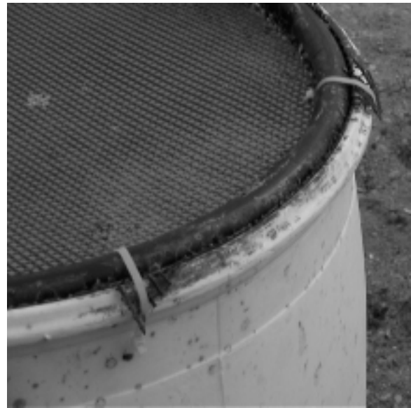
Figure 7 – Coarse mesh held on by cable ties

inexpensive and easy to make, having extra silos for different seed sizes or as quick replacements for damaged units is the way to go. Originally we used stainless steel mesh, which was screwed to the silo. This mesh is expensive and subject to electrolysis, especially when used in a marina setting. Silos should get three “legs” that will keep the mesh from getting damaged. Separate legs can be screwed/riveted on or a band made from a drum section with integral legs secured (figure 6).