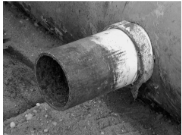
Figure 4 – Four inch nipple in trunkline

secure these "snouts" to the trunkline. Figure 4 shows a section of coupling (about 1-inch) cut off and glued both inside and outside of the trunkline. The snouts are first fitted with the inside section of coupling and then dropped into place one at a time. Then the outside section is added. Alternately, the snouts can be PVC welded in place or glued with PVC cement or 5200 without the coupling slices. The snouts go into holes in the side of the silo. A third way is to glue or weld 4-inch pressure couplings into the trunkline, which require a larger hole saw. These couplings will allow a six to 12 inch long by 4-inch diameter nipple to connect into the silo. Either way, the friction fit created makes removing the silos from the trunkline tool free.