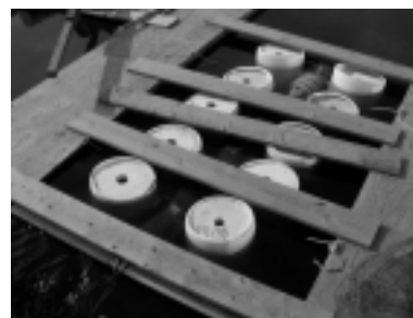
Figure 2 FLUPSY module